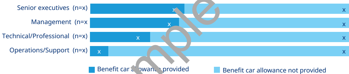
Figure 4.6 Provision of benefit car allowances % of organisations

Benefit car allowances are offered for an employee to purchase/lease a car, primarily to be used for private use. In many cases the employee can choose whether or not to take the allowance as cash, or use it towards a car.